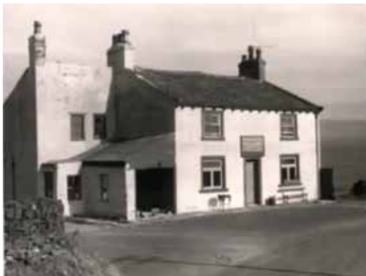
The Colne Clarion House/Farmers' Tavern - date of photograph unknown, but a television/radio aerial is discernible in the original photograph.