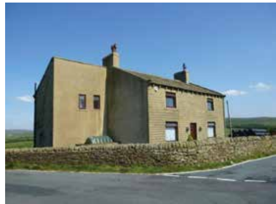
A recent photograph of the former Colne Clarion House

In 1841 the building contained three separate households the heads of each household were Cotton Weavers. Later on one section of the building was a grocers shop and one or more sections became a beer house, sometimes referred to as the Farmers' Arms or the Farmers' Tavern. It was owned at one time by Clough Springs Brewery, Barrowford.