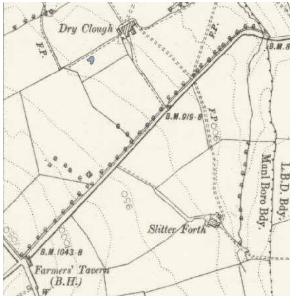
A map published in 1892 showing the location of the Farmers' Tavern