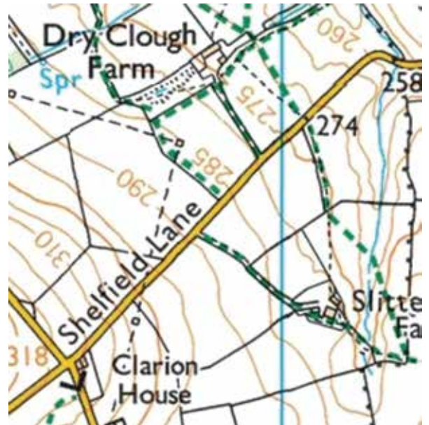
A current map showing the location of the former Clarion House